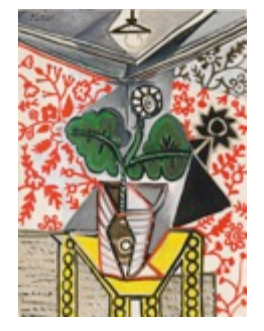
Intérieur Sold for: £7,243,250 ($9,416,225) Estimate: £7-10m