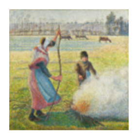
Pissarro Gelée blanche Sold for: £13,296,500 ($17,285,450) Estimate: £8-12m