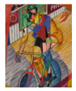
Metzinger Le Cycliste Sold for: £3,015,000 ($3,919,500) Estimate: £1.5-2m