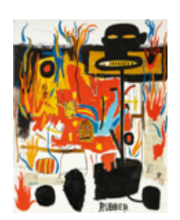
Basquiat Rubber Sold for: £7,487,600 ($9,733,880) Estimate: £6-8m