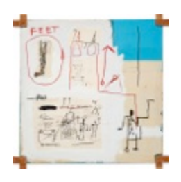
Basquiat The Mosque Sold for: £3,951,729 ($5,137,248) Estimate: £4-6m