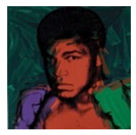
Warhol Muhammad Ali Sold for: £4,973,250 ($6,465,225) Estimate: £3-5m