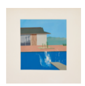
Hockney The Splash Sold for: £23,117,000 ($30,052,100) Estimate: £20-30m