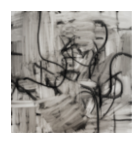
Wool Untitled Sold for: £6,156,809 ($8,003,852) Estimate: £5.5-6.5m