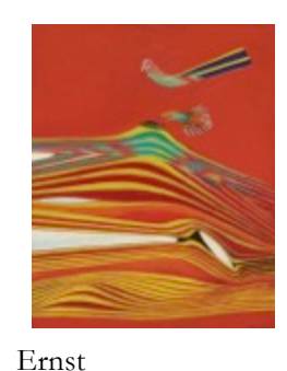
Paysage-effet Sold for: £2,891,250 ($3,758,625) Estimate: £1.5-2.5m